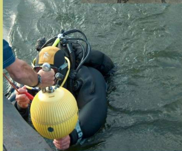
Two-directional electromagnetic current meter S4, with temperature and pressure sensors (Inter Ocean, USA)