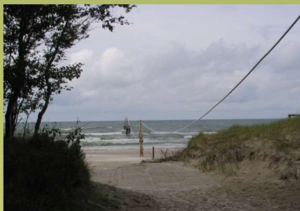
Measuring towers at IBW PAN Coastal Research Station in Lubiato