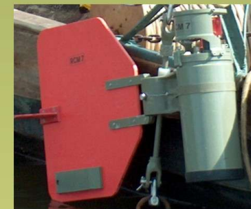
Rotor current meter (Aanderaa Instruments, Norway)