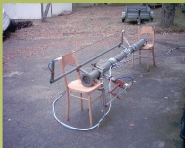
String wave gauge (manufactured at IBW PAN) + two-directional electromagnetic current meter (Valeport Ltd., UK) for measurements of waves and currents in shallow nearshore zone

IBW PAN, ul. Kościarska 7, 80-328 Gdańsk; www.ibwpan.gda.pl