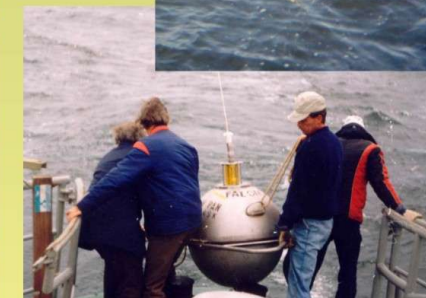
Wave buoy Directional Waverider (Datawell B.V., the Netherlands)