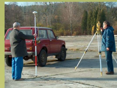
GPS and geodesic equipment