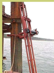
Particle Size Analyser LISST-100 for measurements of concentration and grain size distribution of suspended sediment (Sequoia Scientific, USA)