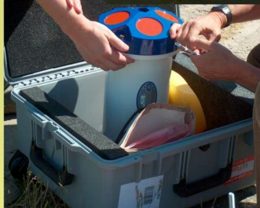
Acoustic Doppler Current Profiler Workhorse Monitor (RD Instruments, USA)